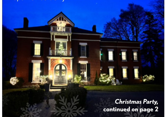
Christmas Party, continued on page 2

Because the party is being held in a private home it is necessary to limit the number of guests to ACO Port Hope members only.