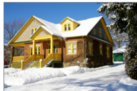
46 Dorset Street East