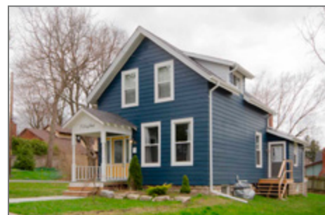
27 College Street