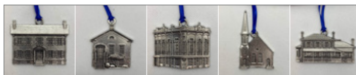
The Bluestone The Little Bluestone The Music Hall Canton Church The Grange

The ornaments are a great way to support the conservation of the amazingly unique heritage landscape that is at the heart