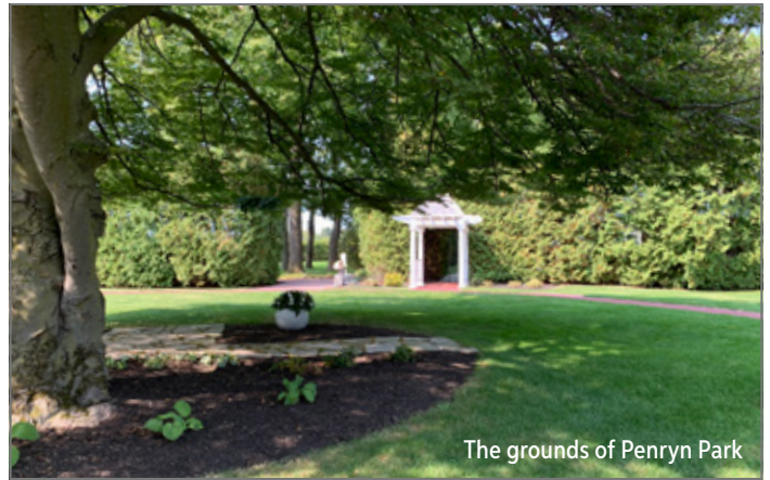
The grounds of Penryn Park