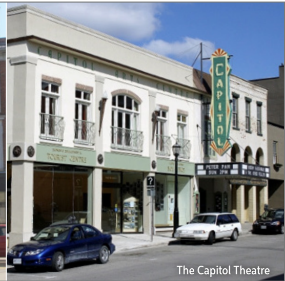
The Capitol Theatre

concentrating on ships with a history founded in Port Hope.