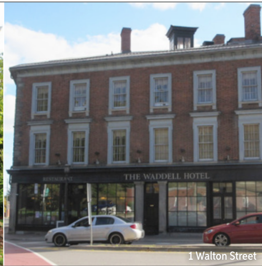
1 Walton Street