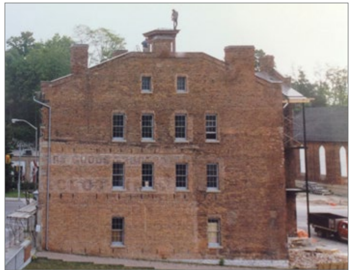
West side of 1 Walton — Note three rows of floor joists; the outline of 2-storey Torvill Terrace; windows put in by Rungays; workmen installing cupola replaced by Rungays.

was also working on St. Michael's Cathedral and St. Paul's Church (later Cathedral) in London, Ontario.