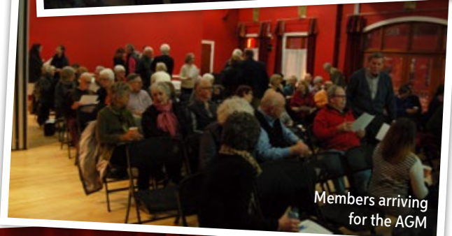
Members arriving for the AGM