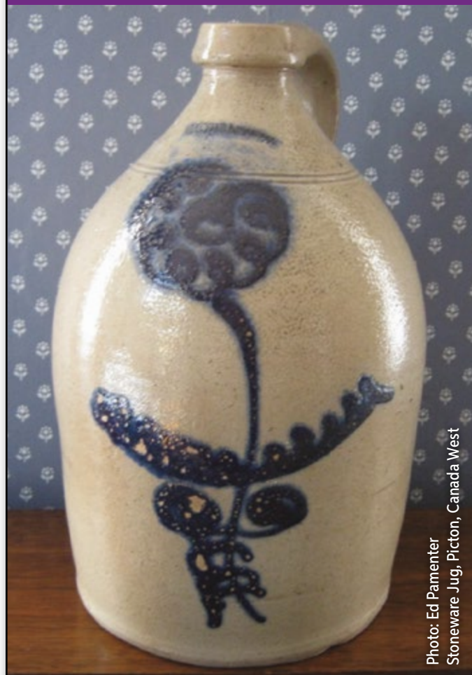
Stoneware Jug, Picton, Canada West