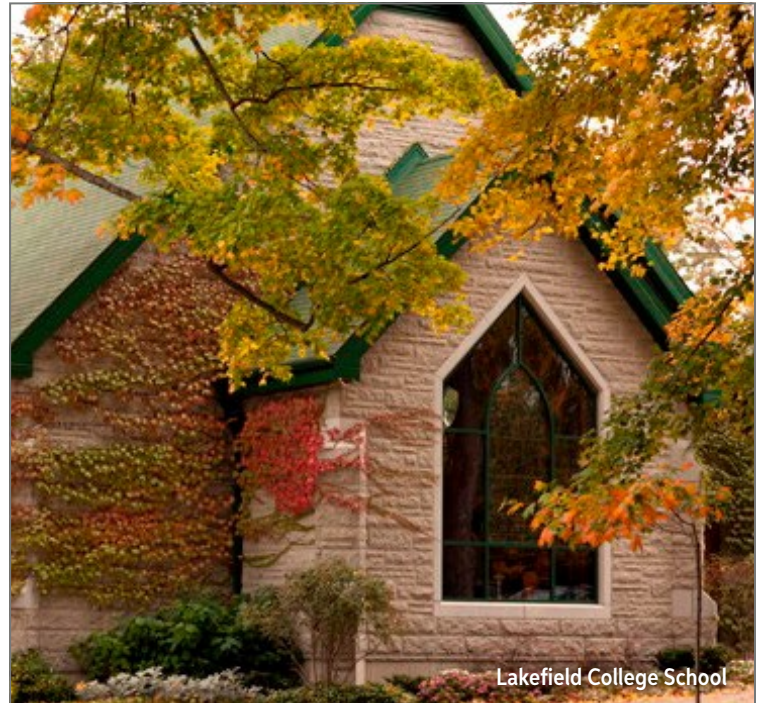
Lakefield College School