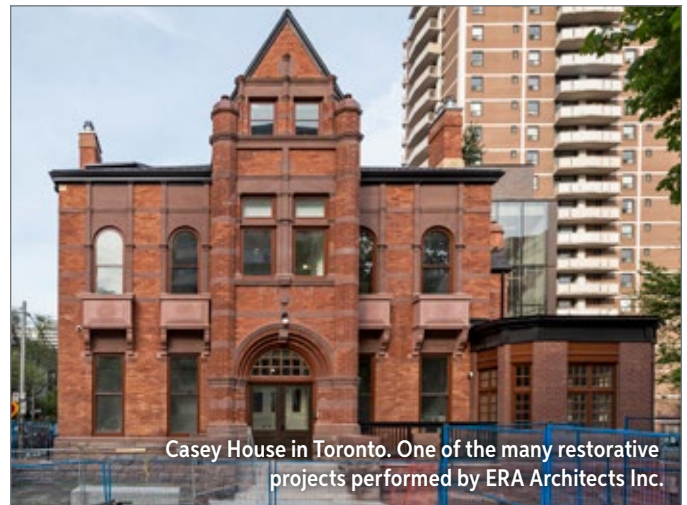
Casey House in Toronto. One of the many restorative projects performed by ERA Architects Inc.